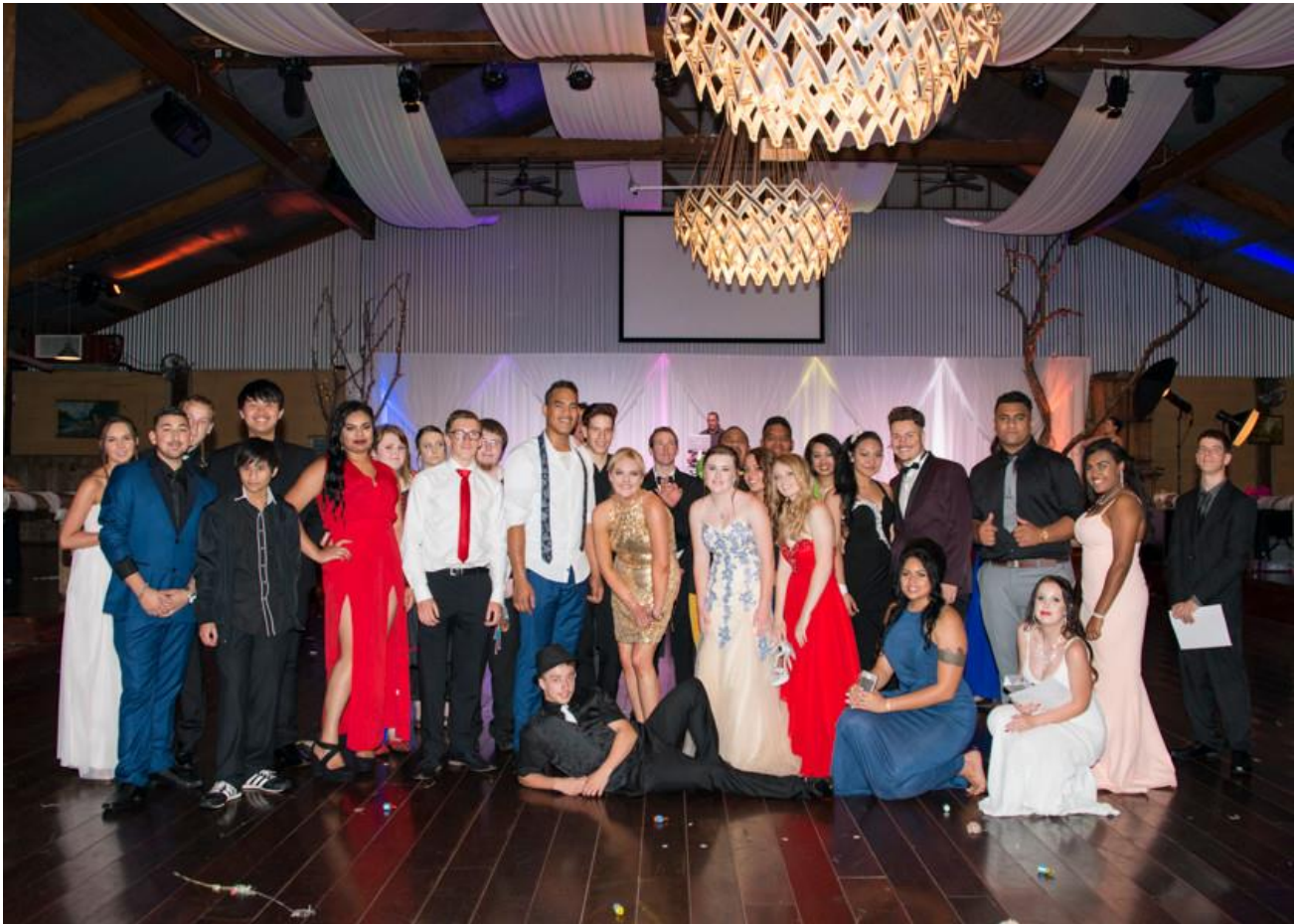
YEAR 12 2015